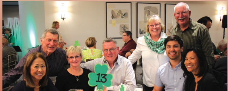
Fairways to Heaven registration is now open! Visit us in the courtyard today.